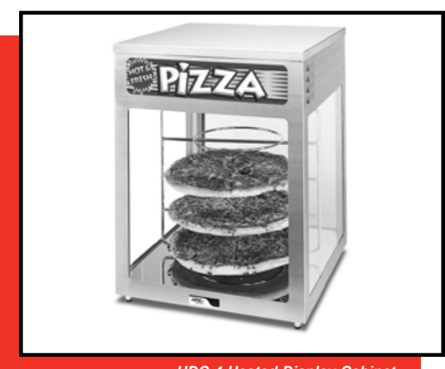
HDC-4 Heated Display Cabinet